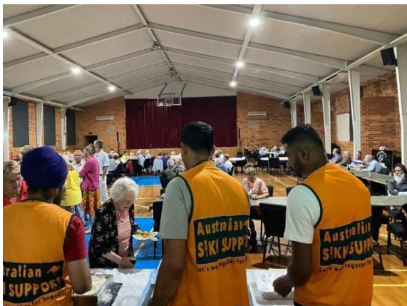
Sikhs serving dinner after the FREED Concert.